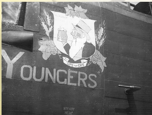
463 - Y JO - Y "Youngers"

The winter of 1944 was as hard as any other of the three years most of