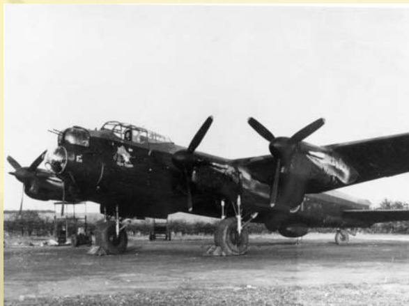
463-P JO-P “Piratical Pete”

It was a particularly bitter night in the winter of 1944 as the Warrant Officer made a last check of the dispersals of his Flight at 463 Squadron, Waddington. Snow swirled around him as he trudged from bay to bay, it was not a night to be out. Under the wing of a Lancaster something moved, instantly alert the W/O cautiously approached a man. To put the other off-guard he bellowed at him “Who the bloody hell are you?”