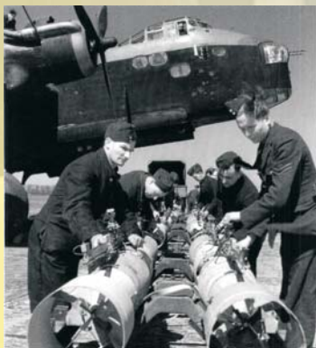
Tail fused bombs being prepared at a Stirling squadron

That shock wave hit the aircraft with such violence that it ripped