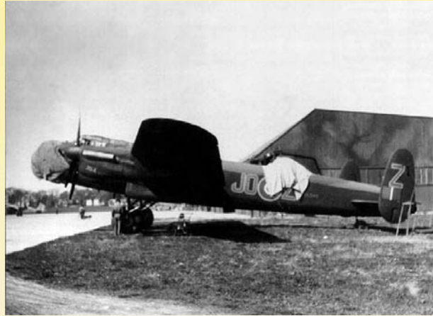
463 - Z JO - Z Landed safely in Sweden by Flying Officer A Cox after D Day (yellow outlines on lettering set the date as after 6/6/1944)