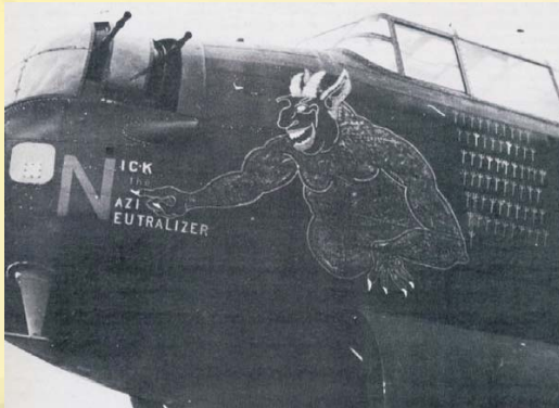
463 - N JO - N Nick the Nazi Neutralizer JO - N

For the crew it was a two-edged sword, relief that they would be spared a night of Flak and weather over Germany. On the other hand, it meant they would have to make up another trip to complete their thirty operation tour of duty.