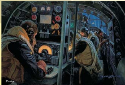
Radio operators position in a Lancaster

463 - P JO - P The Australian Armourer has a lambskin vest send by an Comforts Fund from Home