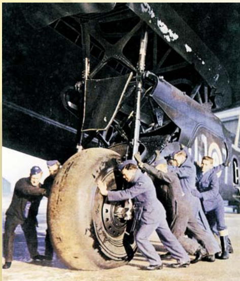
RAF fitters pushing a Lancaster into position for hangar maintenance the Lanc used a pneumatic bag brake system

The usual process at the range was to explode the items piece by piece. However there was a party on at the Mess that night, so Pa had the whole lot grouped and wired together for a single explosion. It was perhaps the biggest explosion in the UK to that time and rocked the glasses on their shelves at Waddington fifteen miles away.